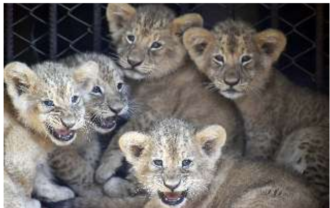
05 lion cubs were born from lioness "Bijli" on 22nd November, 2022