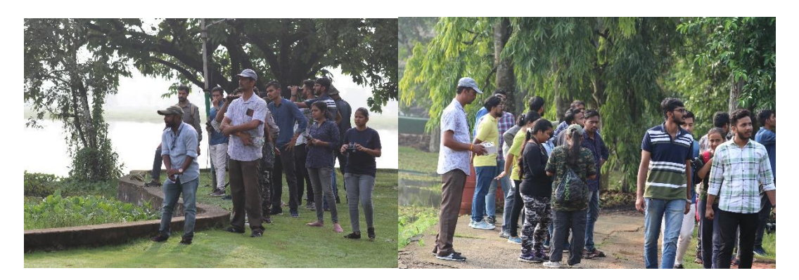
Keepers Talk – Animal in Focus: Tiger